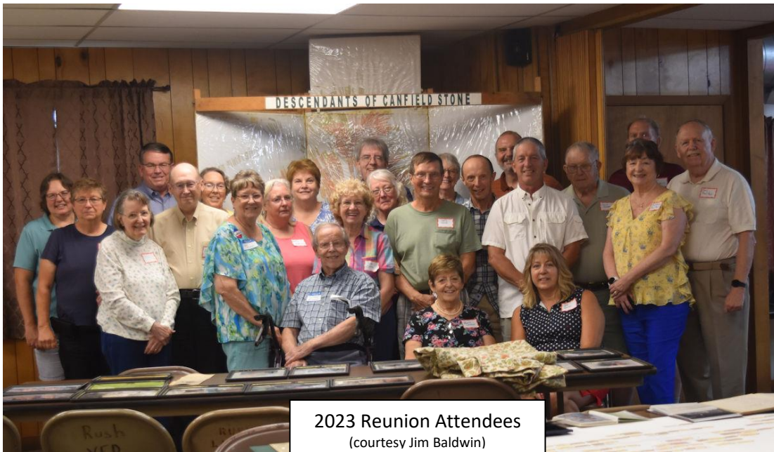
2023 Reunion Attendees

The Reunion will be held on July 27, 2024 and we look forward to seeing our regular attendees, as well as new members or guests. Please join us if you can.